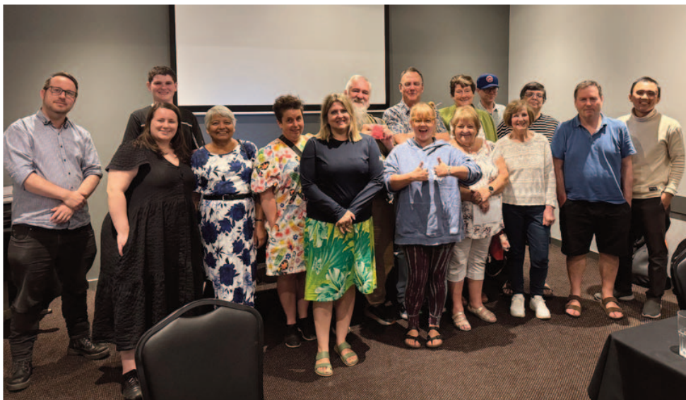
Friday Night Scrabble Players, Victoria. A fun way to end a working week