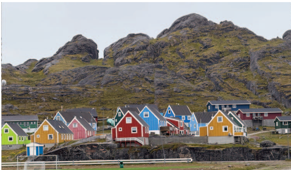
Paamiut, Greenland. Different coloured houses once signified their role.

served and the service centre had disabled the engine (if it had one) as a security measure to get back at people who didn't pay. The cops were arranging for it to be towed out of the way as hundreds of vehicles needed our space. The driver managed to get an unlock code so we were able to get out of there.