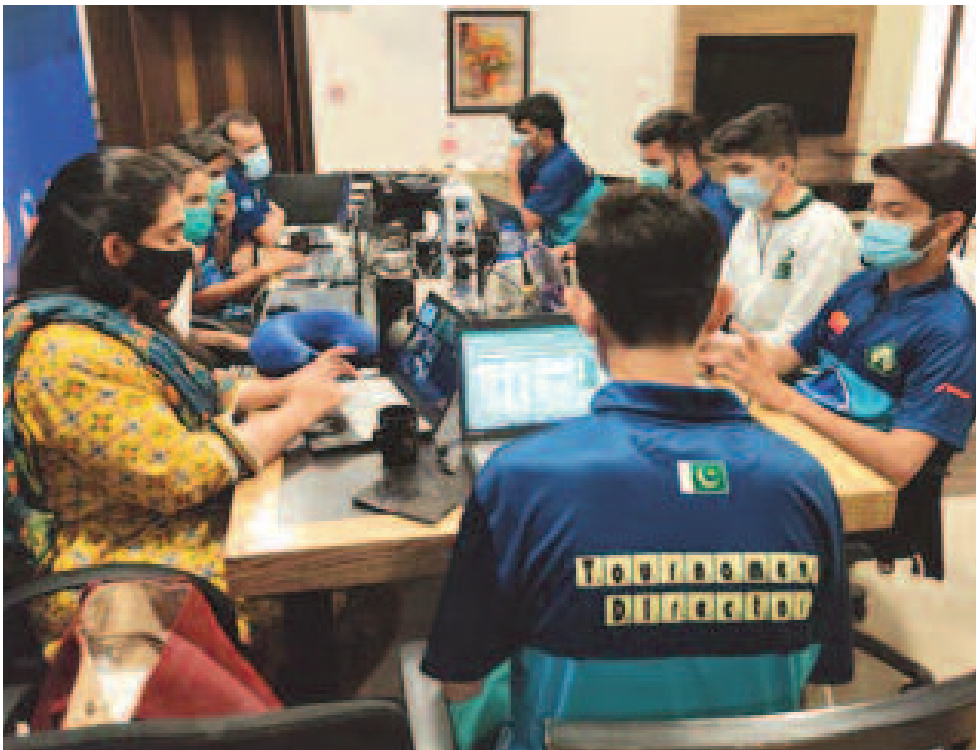
The monitoring team