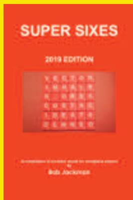
Definitions, 187pp, $26