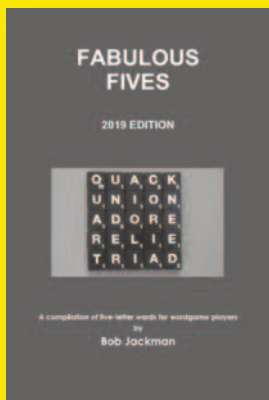
Definitions, 147pp, $22