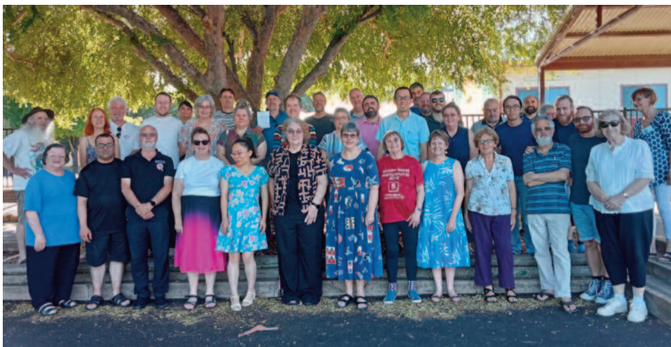
Participants in the South Australian Championship held earlier this year.