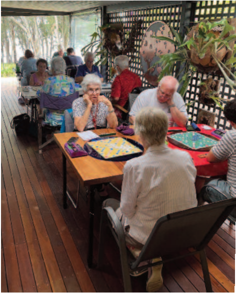
Lake Macquarie Tournament in full swing