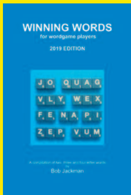
2 to 4 letters, definitions, 138pp, $22